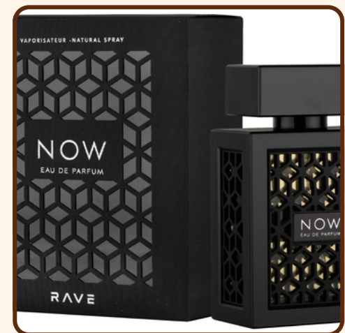
NOW (ALL COLORS)