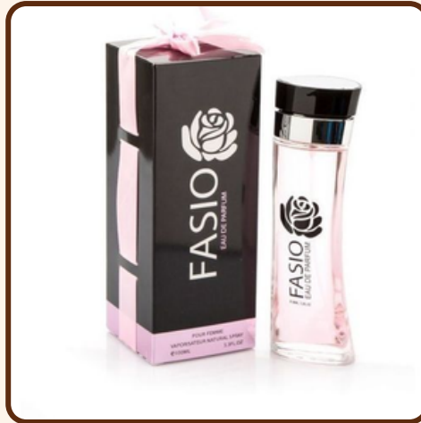
FASIO POUR FEMME