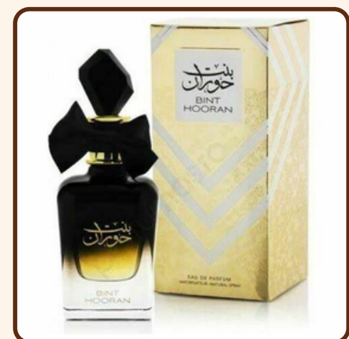
BINT HOORAN GOLD