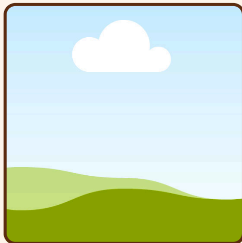
GENTLEMEN (GENIUS/EXTREME/ INTENSE)