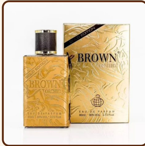
BROWN ORCHID GOLD EDITION