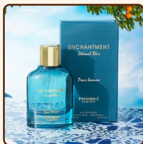
ENCHANTMENT ETERNAL BLUE