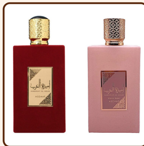
AMEERAT AL ARAB (RED/PINK)