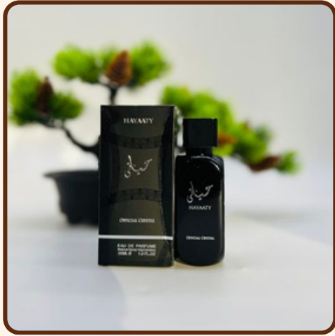
HAYAATI (BLACK/PINK/G REEN)