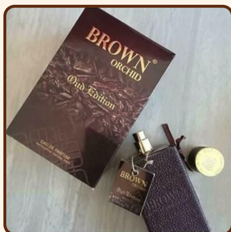
BROWN ORCHID OUD EDITION