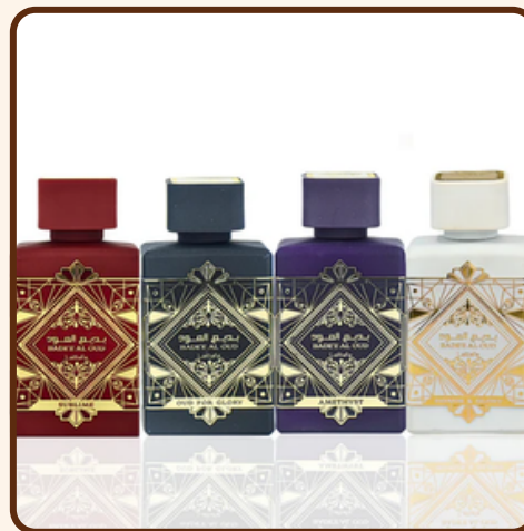
BADEE AL OUD