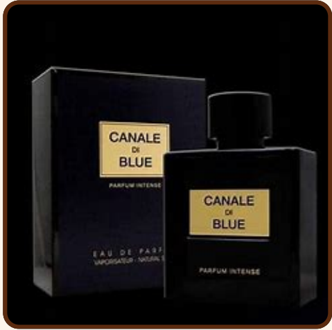
CANALE DE BLUE