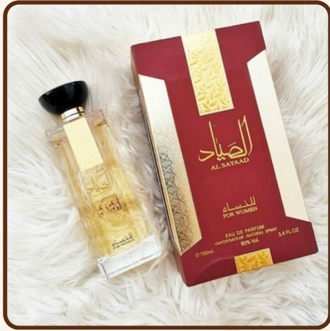
AL-SAYAAD FOR WOMEN