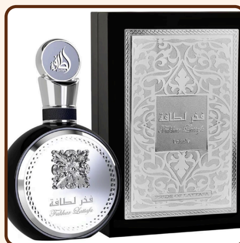
FAKHAR LATTAF (ALL COLORS)