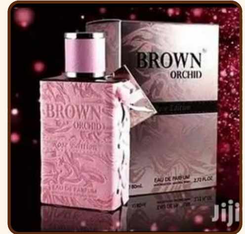
BROWN ORCHID ROSE EDITION