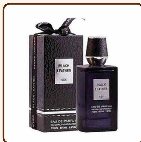
BLACK LEATHER MEN