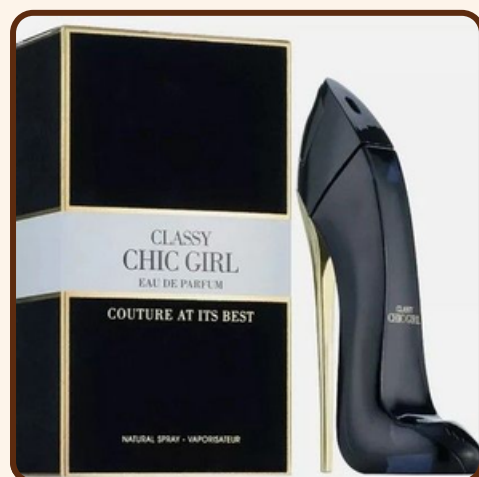
CLASSY CHIC GIRL