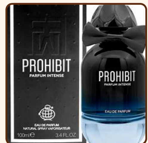
PROHIBIT PARFUM INTENSE