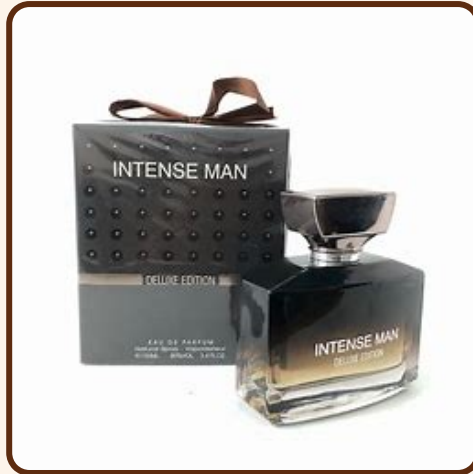
INTENSE MAN DELUXE EDITION