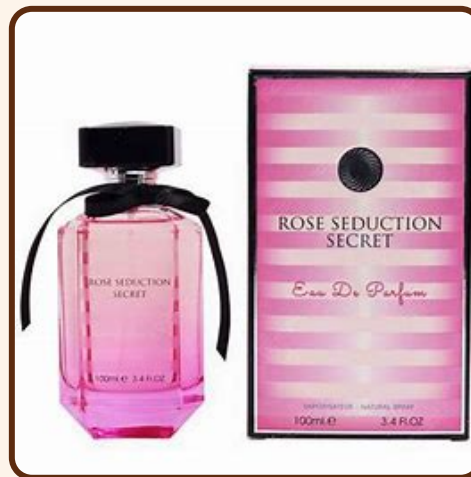
ROSE SEDUCTION SECRET