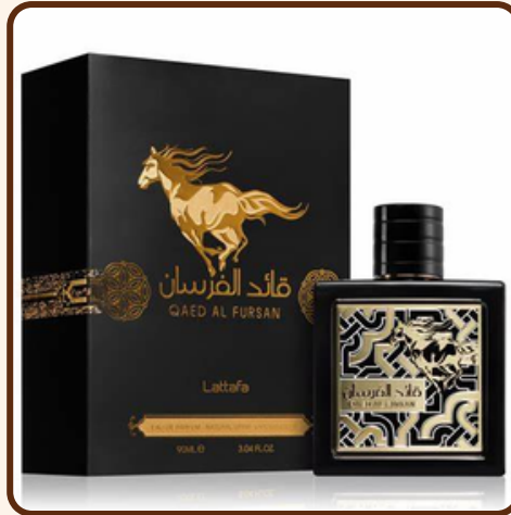
QAED AL FUSSAN SCANDANT BELLA (ALL COLORS) CELINE WOMEN