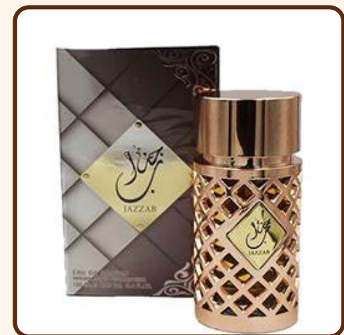
JAZZAB (BROW N/GREY)