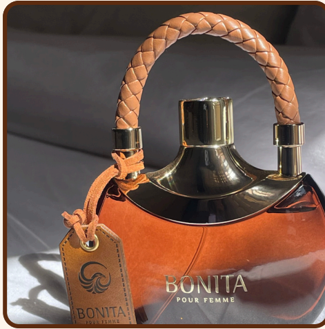
BONITA POUR FEMME