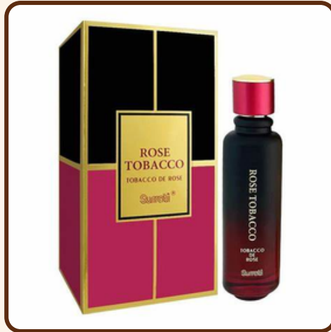
ROUSE TOBACCO SHAMS AL EMASAT KHUSUSI