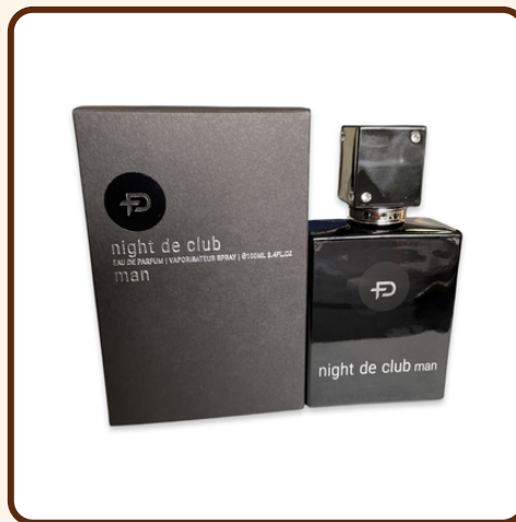
NIGHT DE CLUB