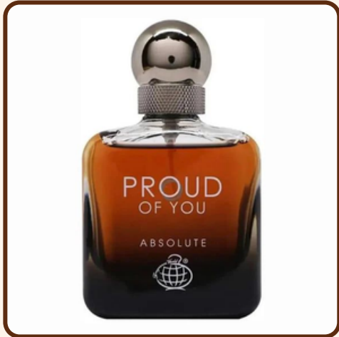
PROUD OF YOU