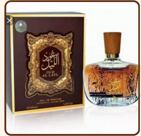
OUD AL LAYL