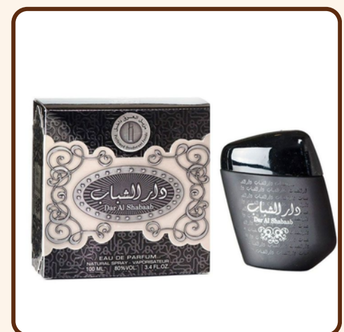
DAR AL SHABAAB