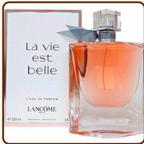
LA VIDA ES BELLA